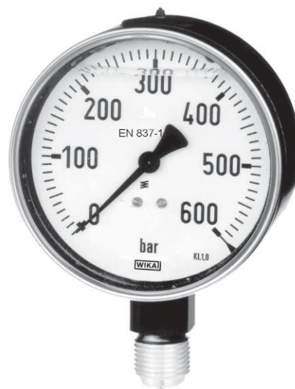
Bourdon Tube Pressure Gauge Model 213.40, radial connection